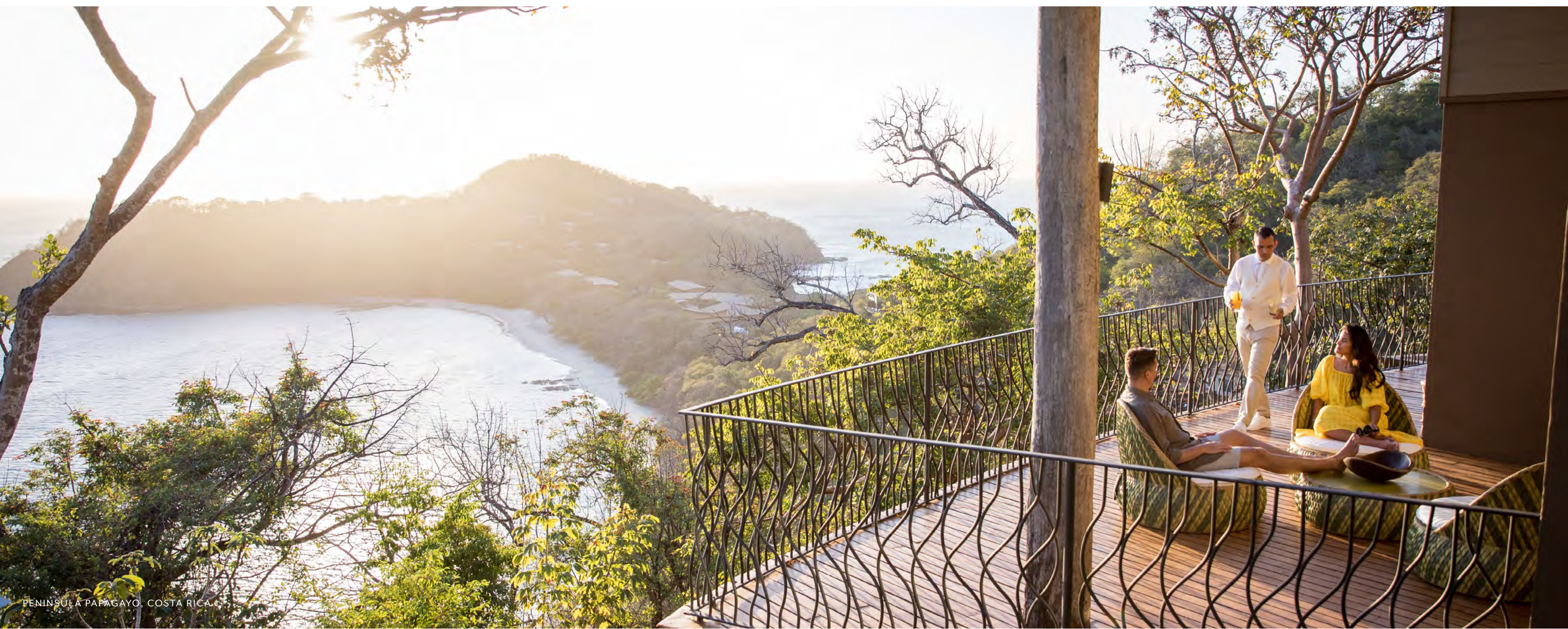
PENINSULA PAPAGAYO, COSTA RICA