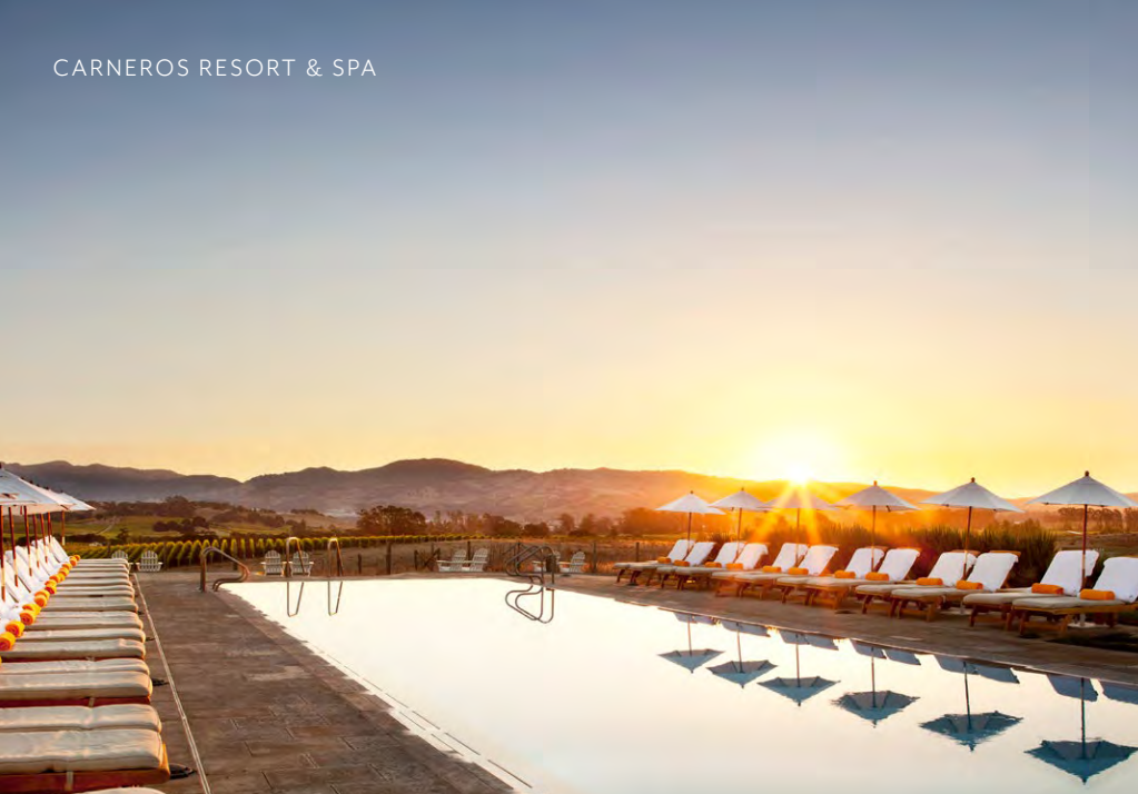
CARNEROS RESORT & SPA