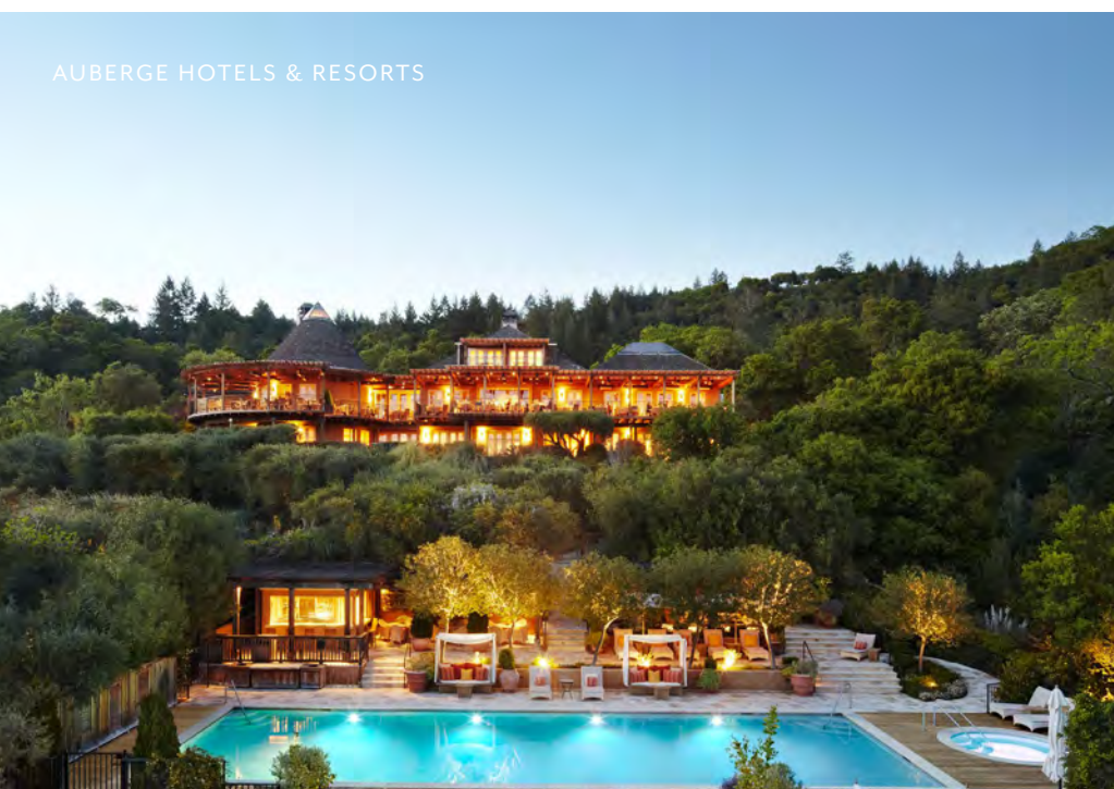
AUBERGE HOTELS & RESORTS

Taj Exotica Resort & Spa The Cloister at Sea Island The Palms Turks and Caicos The Peninsula Hotels The Ranch at Live Oak Malibu The Resort at Pelican Hill Rosewood Mayakoba Singita Singita