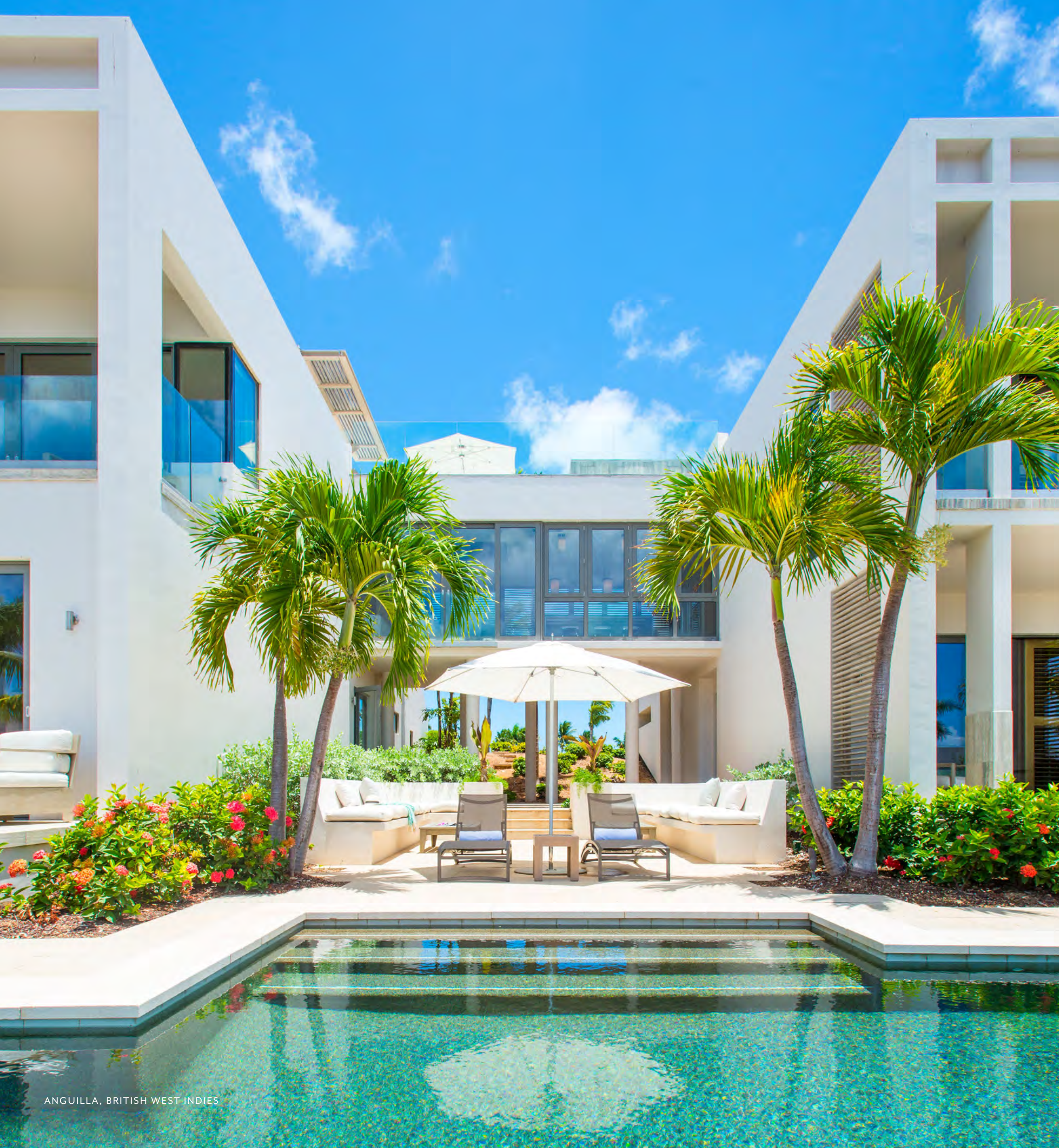
ANGUILLA, BRITISH WEST INDIES