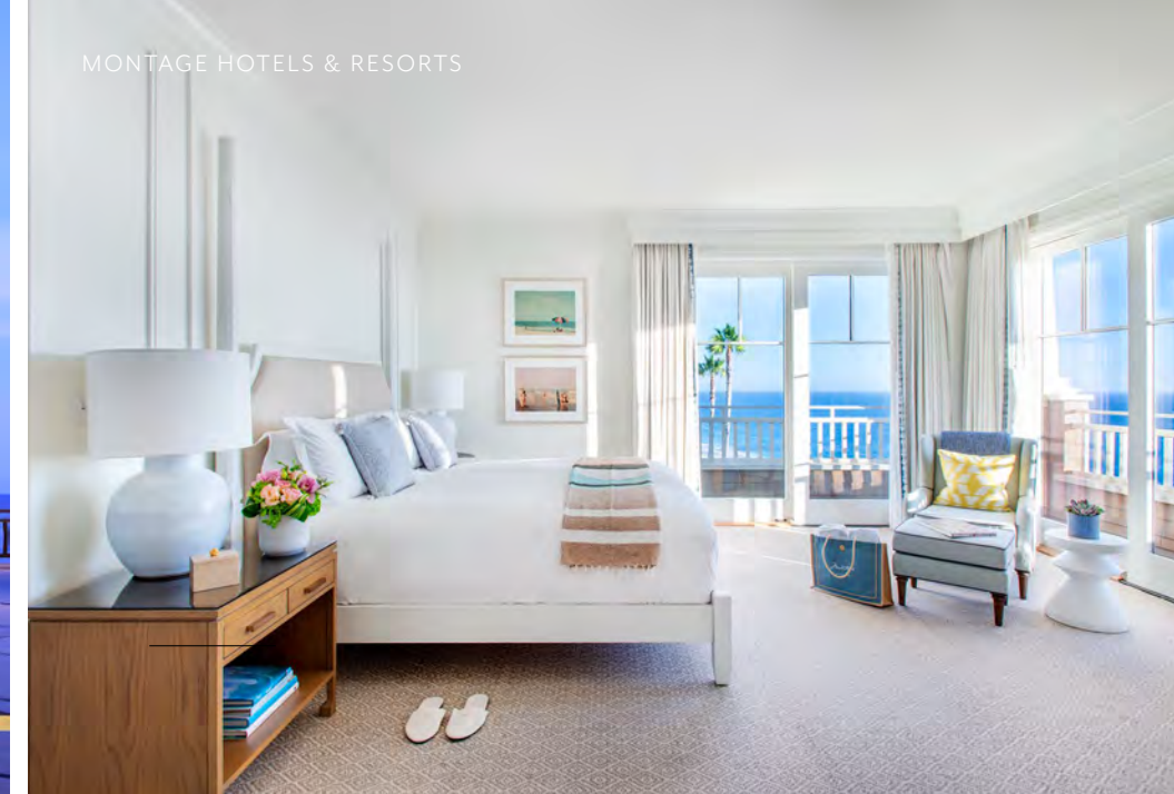
MONTAGE HOTELS & RESORTS