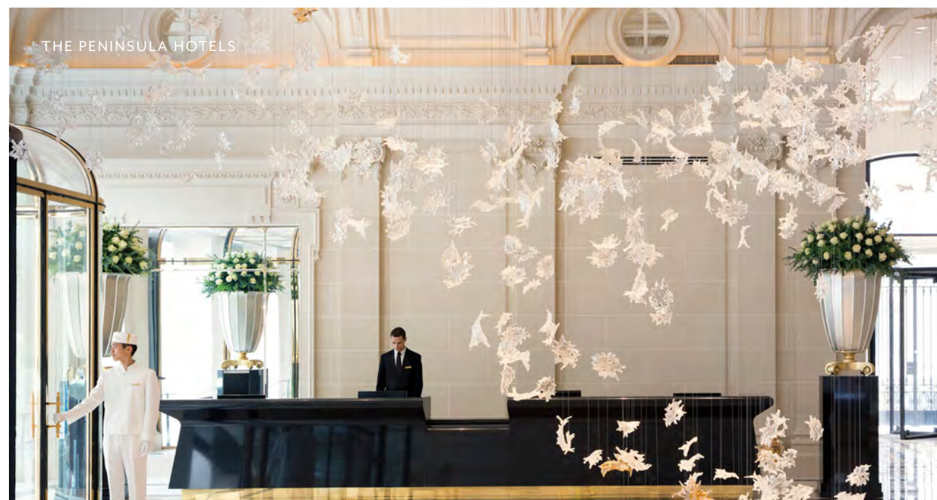
THE PENINSULA HOTELS